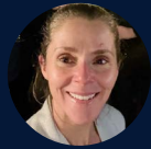
Yami Trequesser Value Retail PLC