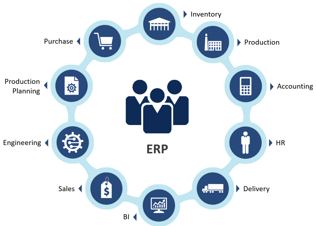
Figure 2: An ERP System Integrates Many Applications that May Benefit from Blockchain.

The major limitation of blockchain at this moment in time is the fact that applications for its use are still emerging, and full adoption may take a couple of years. Buyers and sellers will have to configure their systems to be compatible with each other, including syncing encryption protocol that requires a private cryptographic key for each user. Additionally, organizations will need some degree of process standardization and transformation to fully realize benefits. Currently, financial institutions appear to be the early adopters.